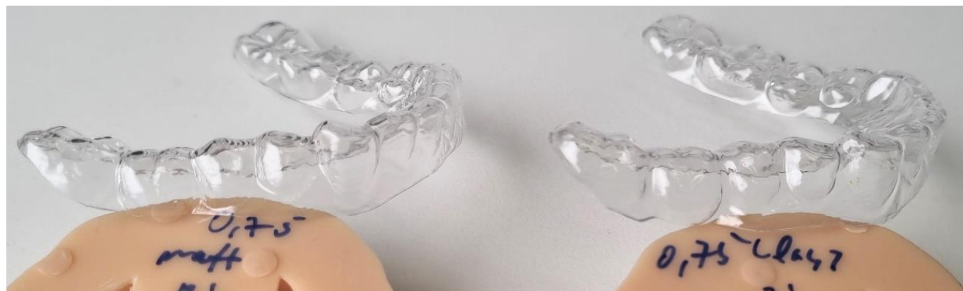
Figure 2: Aligner manufacture with CA® Pro 0,75 with matte surface (left) und clear surface (right)